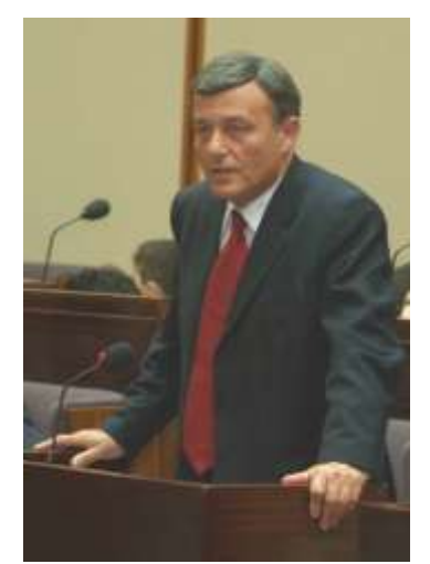
The Hon. Dr Alfted Sant, Leader of the Opposition

concrete proposals to promote environmental education that could be tabled for approval by the parliament.