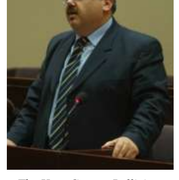
The Hon. George Pullicino, Minister for Rural Affairs and the Environment

concrete proposals to promote environmental education that could be tabled for approval by the parliament.