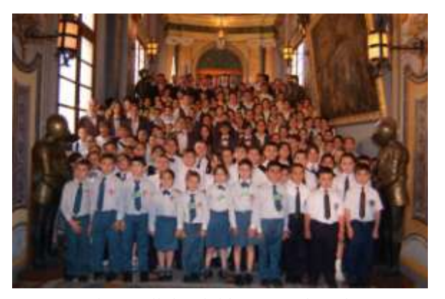
Group photo: all the children attending the event with the MPs