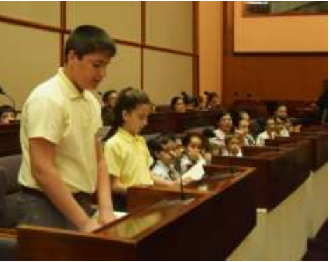
Students reading the Motion about EkoSkola presented to the House of Representatives

From what has been achieved till now, it is quite clear that EkoSkola is helping in the holistic development of our schools. Moreover, EkoSkola is helping us collaborate more with our Local Councils for the benefit of our localities. EkoSkola is becoming more and more popular and it will not be long till certain schools receive the Green Flag, which is a world-renowned certificate testifying that the school that received it is seriously committed for the care of the environment.