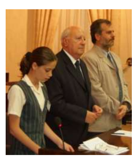
Reading of the introductory prayer

He welcomed the students whom he praised for their "strong sense of citizenship" and their "genuine commitment to do something positive for the environment, rather than complaining about what others should do". In his concluding comments he stressed the need to invest in this programme by pointing out that "if these citizens are already fully committed to the improvement of their environment, imagine the greater contribution that they will offer their country in the future".