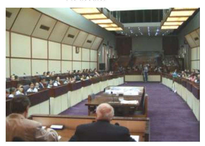
General view of the EkoSkola Parliamentary session

"Parliament should have more sessions like this one. For once I attentively listened through everything that was being presented during the debate."