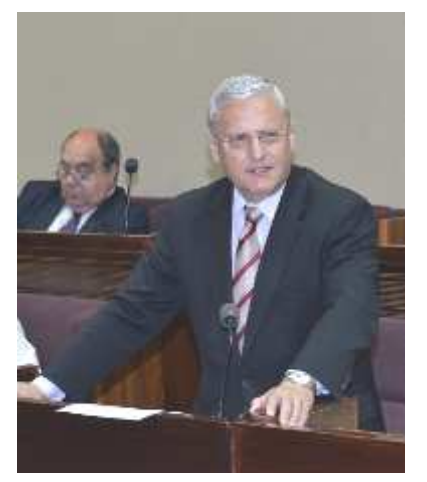
Hon. Leo Brincat, Minister for the Environment, Sustainable Development & Climate Change

attention and that adults need to learn from them. He pointed out that they have access to families. "You are change agents and education is the tool that will change our mentality".