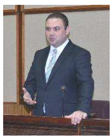
Hon. Owen Bonnici, Minister responsible for Justice, Culture and Local Government

Four members of parliament then replied to the issues raised in the declaration.