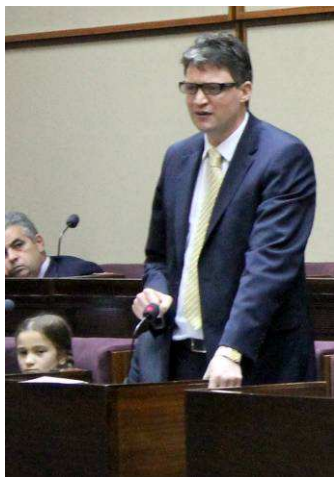
Hon. Dr Konrad Mizzi, Minister for Energy and Water Conservation

In his address, the Hon. Dr Simon Busuttil, Leader of the Opposition, pointed out that sustainability is a common theme during parliamentary debates. However, it is not enough to talk about it, action is needed and that is when problems arise due to implications for economy. He also remarked that his experience of students at parliament was always a positive one. "My wish is to see you [students] taking up a seat at parliament so that you can influence your country's future".