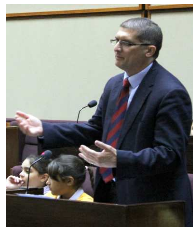
Hon. Charlo Bonnici, Opposition spokesperson for Sustainable Development, the Environment and Climate Change