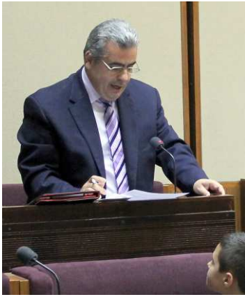
Hon. Michael Falzon Government spokesperson

of parliament need to feel privileged that they have been entrusted with the responsibility of caring for Malta's future. "You [the students] are not just the future, but also the present. I hope to see you taking a seat here at parliament as curators of our future".