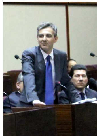
Hon. Dr Simon Busuttil, Leader of the Opposition

As in previous years, the event proved to be a huge success and was widely reported in the local media. The EkoSkola Steering Committee would like to thank all those who made this experience possible particularly the Hon. Mr Speaker, Dr Anġlu Farrugia and his Office for granting us permission to use the premises.