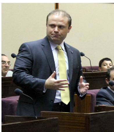
Hon. Dr Joseph Muscat, Prime Minister

Hon. George Pullicino, Opposition spokesperson for Energy and the Conservation of Water, expressed his delight that the EkoSkola experiment that was started 10 years ago was giving tangible results. He pointed out that Malta is the only country