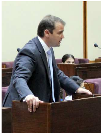
Hon. Franco Mercieca, Parliamentary Secretary for Active Ageing and Disability Rights

environmental decision making because they have these issues at heart". She pointed out that this was shown when students had a direct input in the eco-Gozo vision by presenting concrete ideas for the improvement of Gozo's quality of life.