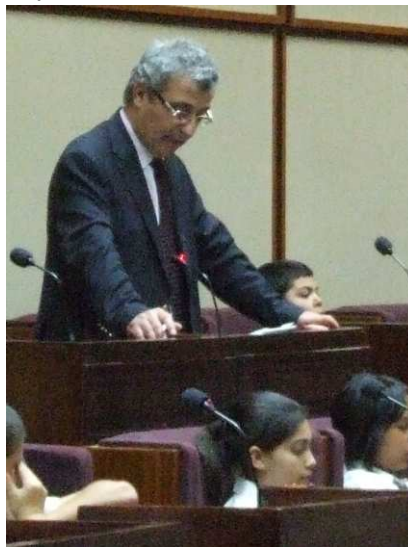
Hon. Evarist Bartolo, Opposition spokesperson for Education & Media

Bartolo, Opposition spokesperson for Education & Media. He remarked that EkoSkola presents one of the most beautiful aspects of our educational system because of the opportunities it offers for student active participation. "We adults have meddled with the environment and created an uncertain future. The least we can do is to heed their requests" .