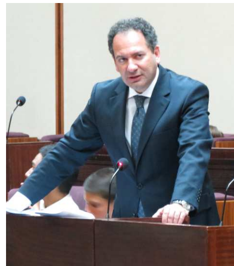
The Hon. Dr Mario de Marco, Minister for Tourism, the Environment and Culture