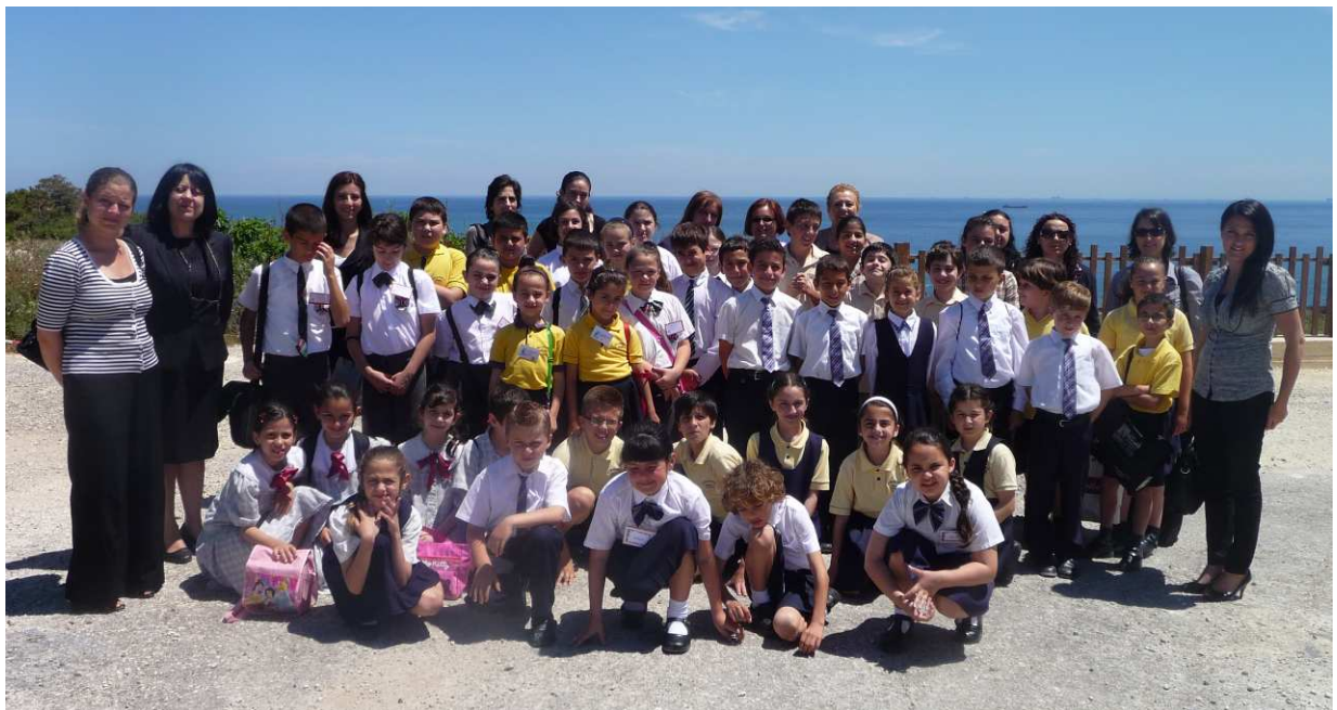
Participants in the Young People's Environmental Summit