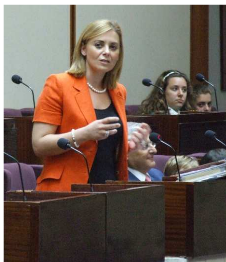
The Hon. Dr Justyne Caruana, Opposition Spokesperson for Family, Children and Persons with Disability

The Hon. Dr Justyne Caruana, Opposition Spokesperson for Family, Children and Persons with Disability, thanked the organisers of the event ... particularly the students. She drew her colleagues' attention towards the students' sense of altruism and social commitment. She urged the students to continue with their commitment and appealed to the other members of parliament to assist these children "in the defence of our future ... and let us implement their suggestions so that we show them that we care" .