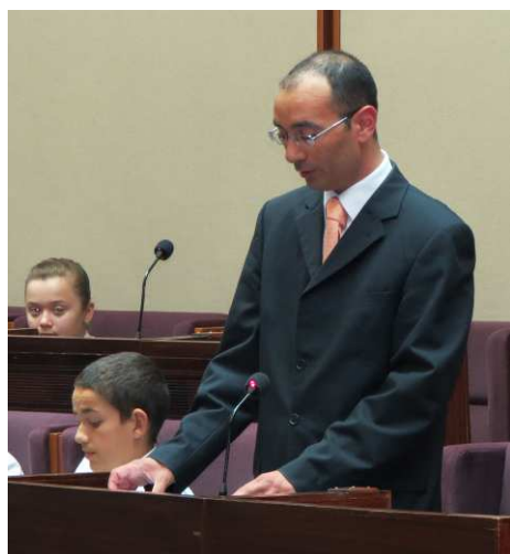
Hon. Joseph Falzon, Deputy Party Whip for the Government

In his reply the Hon. Joseph Falzon, Deputy Party Whip for the Government, representing the Hon. Giovanna Debono, Minister for Gozo (who was attending another official function) highlighted how Eco-Gozo initiatives were addressing sustainable lifestyles. The major thrust of these initiatives is education. He pointed out that students are important promoters of values that support sustainable development and "need to be viewed as key ambassadors of sustainability in their communities" .