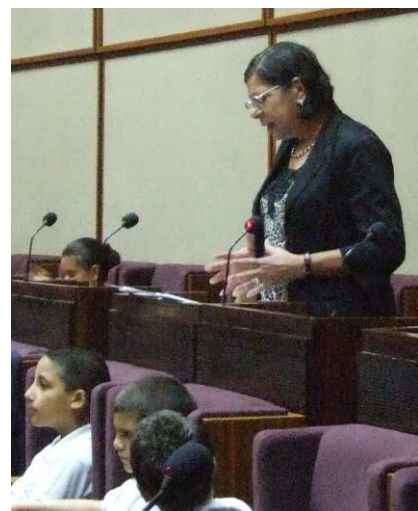
The Hon. Dolores Cristina, Minister of Education & Employment