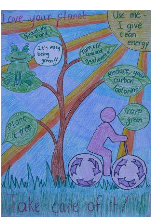
Winning posters of the Children's Category: 1^{st} – France; 2^{nd} – Poland; 3^{rd} – Malta