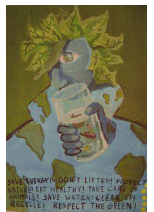
Winning posters of the Youth's Category: 1^{st} – Malta; 2^{nd} – Russia; 3^{rd} – Poland