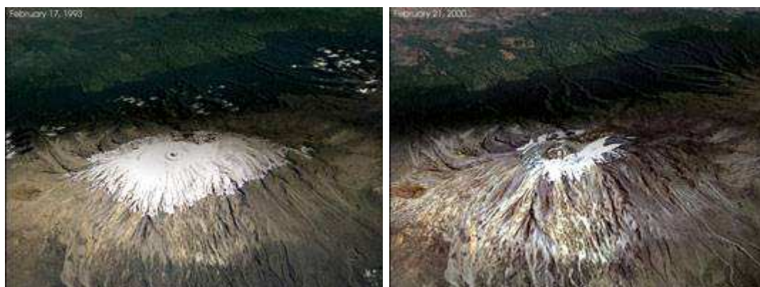
The ice field of Kilimanjaro in Feb 1993 as compared to Feb 2000