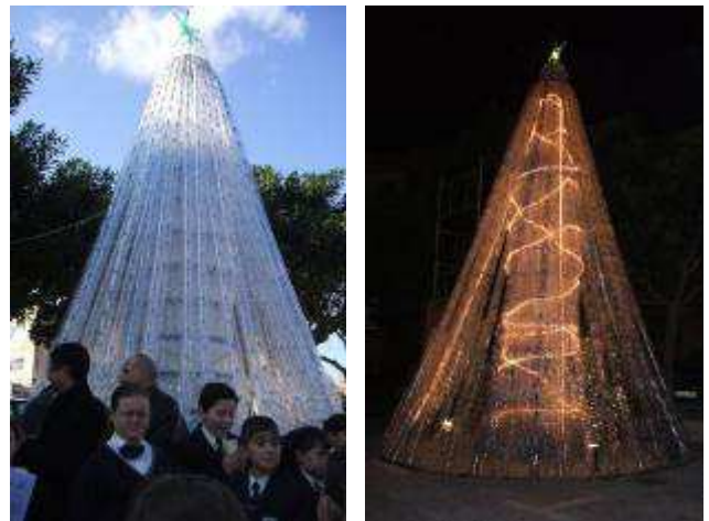
Our plastic Christmas Tree in the morning (left) and all lit up at night (right)

All the school took part in this project. Some classes had to fill in bottles with bits and pieces of left over plastic from Playmobil. These would make the base of the tree to keep it stable. Some classes