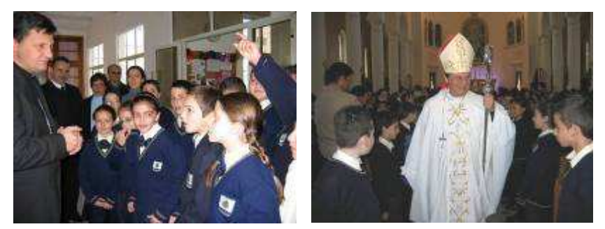
H.E. the Bishop of Gozo, Mario Grech, meeting the EkoSkola Committee members (left) and during the thanksgiving mass (right)

helped to make huge circles of 90 bottles each to make the middle column of the tree. We needed 10 of these! They were really heavy! Other classes had to make 26 rows of 26 bottles into each other to make the sides. These bottles had to be cut from the bottom and fitted into each other with wire. Finally we had to make the decorations. We