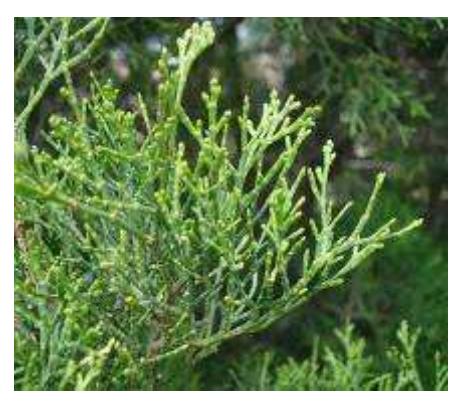
Sigra ta' l-Gharghar (Sandarac Tree)

Hdejja hemm hafna siġar ohrajn, pjanti u fjuri sbieh. L-għaxqa tagħna hi meta tfeġġ ixxemx, għax għandna bżonnha, għalkemm fis-sajf taħraqna. Ir-riħ idejjaqni u jweġġagħli rasi u r-ragħad ibeżżagħni. L-ikbar ħabiba tiegħi hi l-Balluta, u vera ħabiba għax sigriet taf iżżommu. Għandi ħbieb oħrajn bħallfarfett l-aħmar, in-nannakola, il-qanfud u lgħasfur il-griż. Niddejjaq ħafna meta jiġu xi tfal imqarbin jiddendlu miegħi u jqaċċtuli lweraq u jweġġgħuni. Tgħidx kemm nibki.