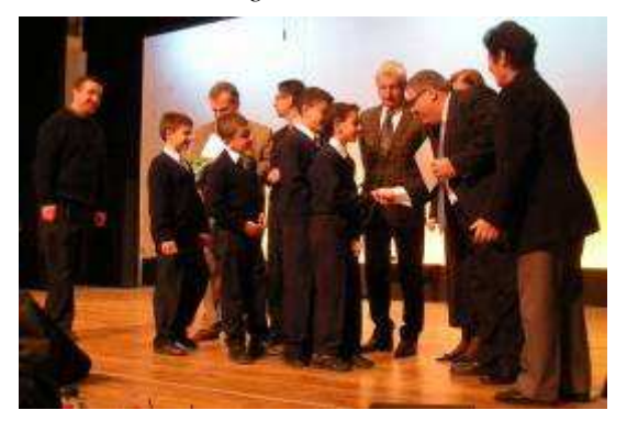
Kullegg San Benedittu, Safi Primary School C receiving the Bronze Award