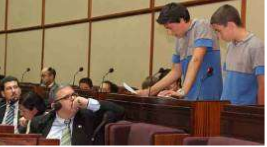
School children presenting their research data and suggestions to the MPs