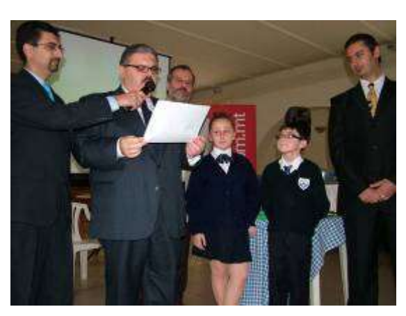
Children from Zurrieq Primary B receiving the Silver Award