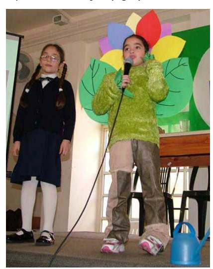
Children from Leli Camilleri - Zurrieq Primary School A explaining one of their EkoSkola initiatives through drama